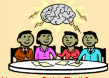
Numeracy Quick Tip:# 3

Use real world examples to teach math. Point out ways that people use math every day to pay bills, balance their checkbooks, figure out their net earnings, make change, and tip at restaurants. Involve older children in projects that incorporate geometric and algebraic concepts like planting a garden, building a bookshelf, or figuring how long it will take to drive to your family vacation destination.